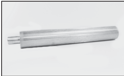
For H pitch pulley stock and flanges, see page 270.

Neoprene H timing belt part numbers can be determined as follows: Pitch Length Code + H + Width Code + (G for fiberGlass reinforcements)